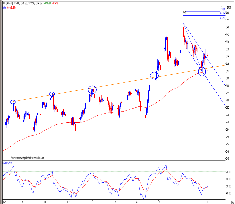
Exhibit 2 : ITC - Daily Chart

ITC has been in a secular uptrend since 2009 forming higher high and higher low on all degree (Daily, Weekly and Monthly). After making lifetime high of 351.50 on May 31, 2013 the stock price seen corrective decline and pause near 311 - 318 range, and takes support at the ascending trend line drawn with adjoining two significant high of October 2012 (286) and February 2013 (298), earlier such trend line act as a resistance till April 2013 and after breakout of such supply line ITC has made strong upmove. As per the change of Polarity rule such supply line has reverse its role and now act as a demand line.